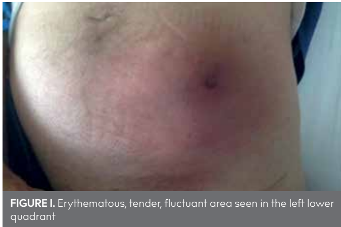
FIGURE 1. Erythematous, tender, fluctuant area seen in the left lower quadrant