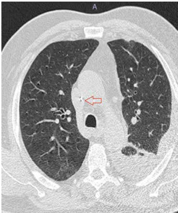
FIGURE 2. The mediastinal air was resorbed (marked with circle)

Because of the proximity to vital organs and severe bleeding tendency, the mortality rate is approximately 65% when the esophagus is perforated. A significant experience is required because of the difficulties in diagnosis and insidious progress of symptoms. In case of a possible delay, the mortality rate increases further (2).