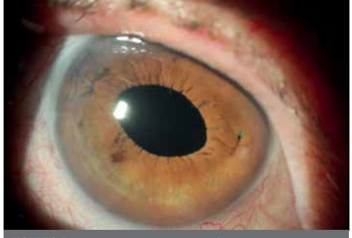
FIGURE 2. Postoperative one month later IOL was well centered and vision is 8/10. IOL: Intraocular lens.

through paracentesis and trocars were removed (Figure le). Mix of dexamethasone and gentamicin injected by subconjunctival route at the end of operation. After 3 months of operation vision was 0.8 with Snellen chart. IOL was centrally located. There was no pathologic fundus finding (Figure 2). Informed consent was obtained from the patient prior to the study.