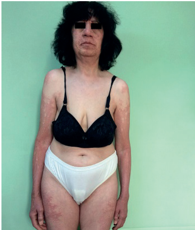
FIGURE 1. Papular lesions on the entire body, including the face; these lesions were particularly prevalent on the arms and nape of the patient.