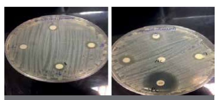
FIGURE I. Antibacterial activity of the hexane extract toward Staphylococcus aureus