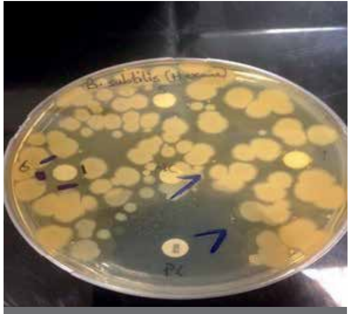
FIGURE 2. Antibacterial activity of the hexane extract toward Bacillus subtilis