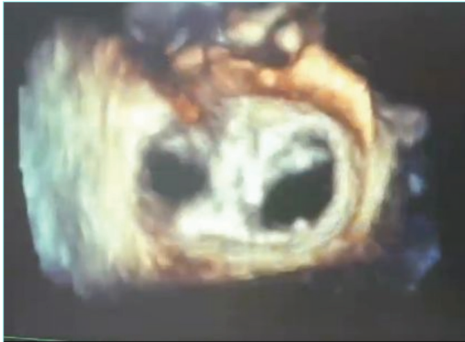
Figure 1. “Owl eye” appearance after MitraClip procedure, visualized with 3D transesophageal echocardiography.

This case report highlights a successful percutaneous mitral valve repair with MitraClip in a high-risk patient with severe mitral regurgitation and a unique “owl eye” appearance of the mitral valve. The procedure